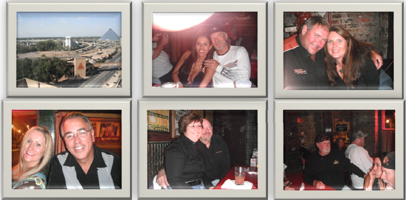
Pictures above are from the 2010 Memphis Overnight Ride. A good time was had by all that attended.