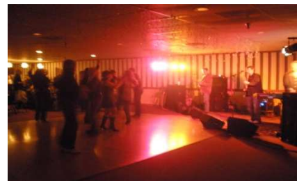
2010 Leather and Lace Dance